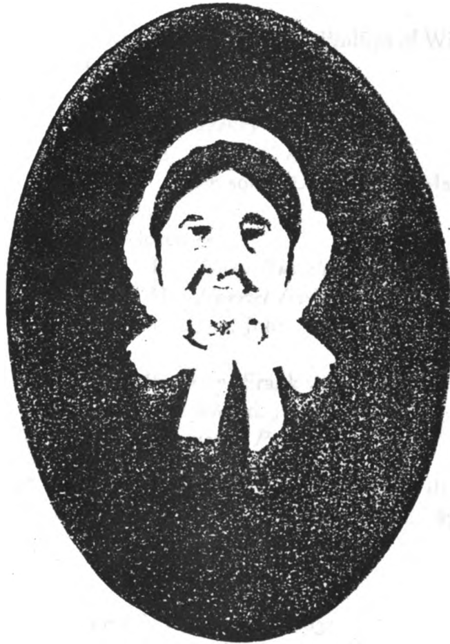
6 PHEBE BAILEY FRY.